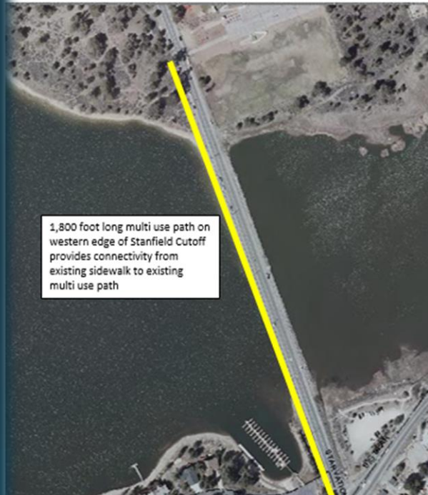
Stanfield Cutoff Connectivity Project Proposed Plan view: